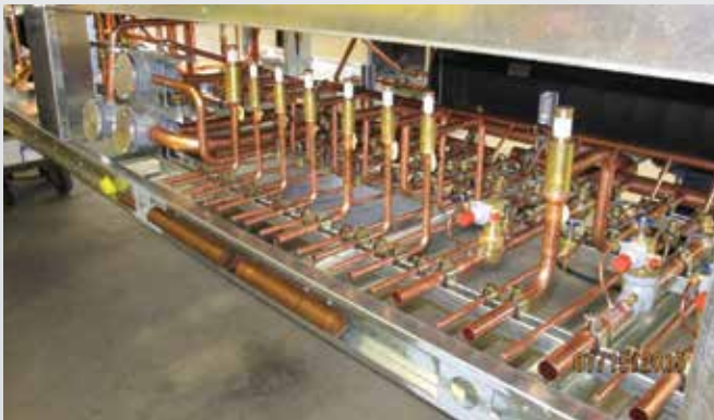
Refrigeration Circuits Under LINK+ Condenser