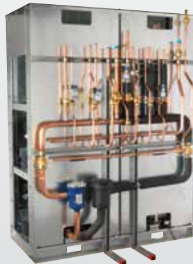
Flexible refrigeration connections