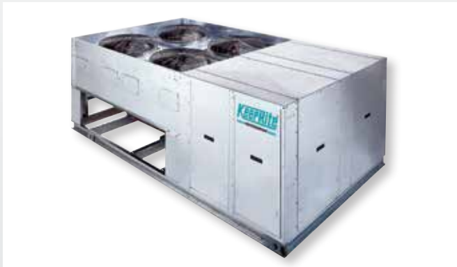
Multiple Compressors in Cabinet with Condenser Attached