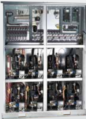
Centralized piping and electrical