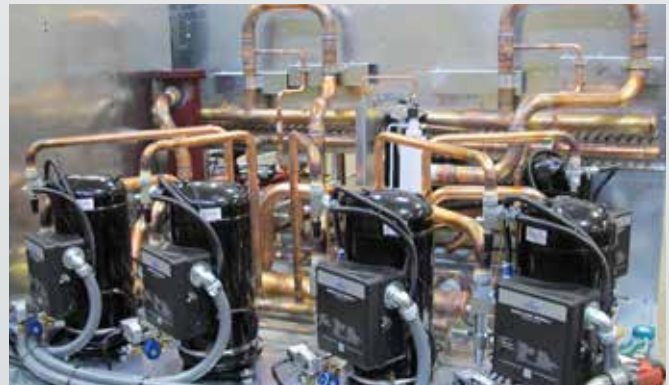
Parallel Piped Scroll Compressors