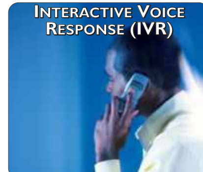
INTERACTIVE VOICE RESPONSE (IVR)

Capture real-time field service information and sales leads via phone.