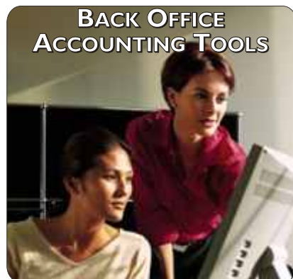
BACK OFFICE ACCOUNTING TOOLS

Manage accounting functions across the entire business.