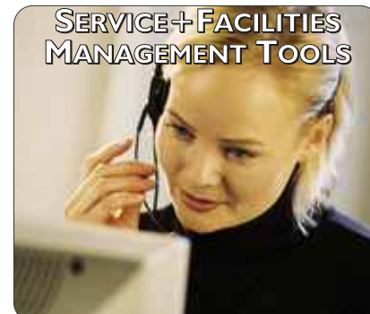
SERVICE + FACILITIES MANAGEMENT TOOLS

Control how you manage resources and efficiently provide service.