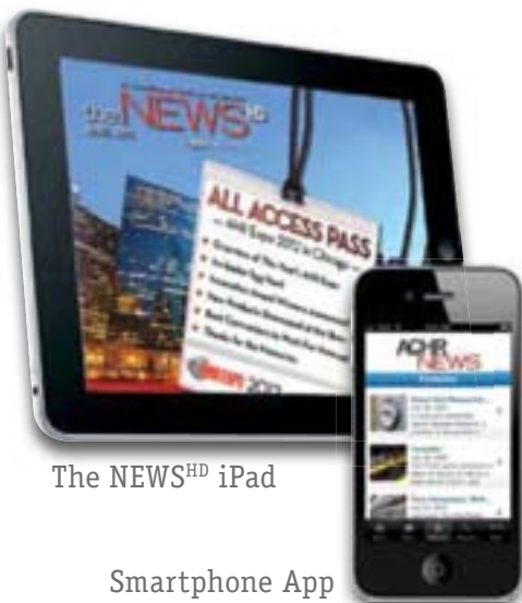
The NEWS HD iPad

Meet the demand for information "Any Way You Want It!" in The NEWS. Reach your customers as they read The NEWS via multiple platforms: iPads, tablets, iPhones, and Androids.