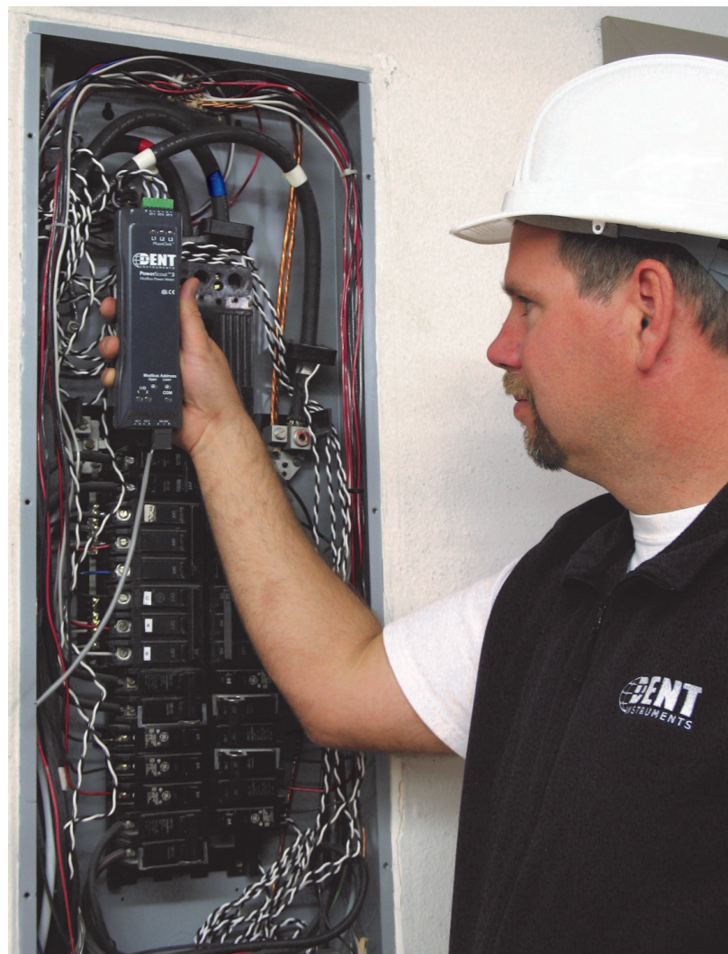
The Next Generation PowerScout™ 3 with Full Utility Metering™.