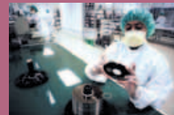
Clean Rooms and Laboratories