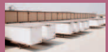
Distribution Centers and Transportation Terminals