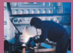
Warehouses and Factories

Mars Air Systems air handling equipment is found "on the job" in a wide range of commercial and Industrial business environments.