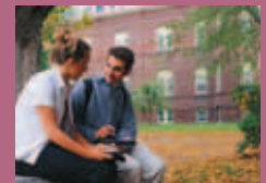
Schools and Universities