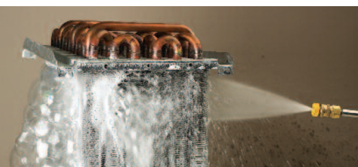
Powerful 100 PSI spray drives cleaning solutions through the fins without damaging them.