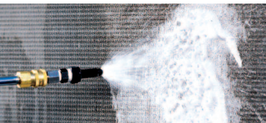
Optional aerated nozzle creates thick foam that penetrates deep into coils.