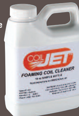
P/N SC-FCC-1 - CoilJet Expanding Foam Available In 1 and 5 Gallon Containers