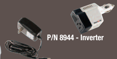
P/N 8944 - Inverter