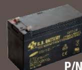
P/N 9689 - Spare Battery